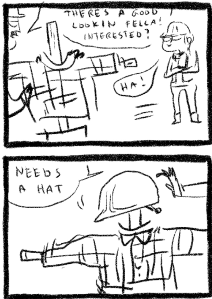
Figure 6: Two panels from Part Four of "Ducks" by Kate Beaton.