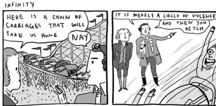
Figure 1: “Infinity” from the series Founding Fathers (Stuck in an Amusement Park) by Kate Beaton.

merely a circle of violence,” and, in a second balloon, “and then you retch.”