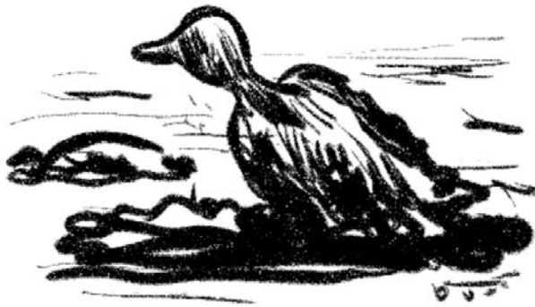
Figure 7: Final, frameless panel from “Ducks” by Kate Beaton.