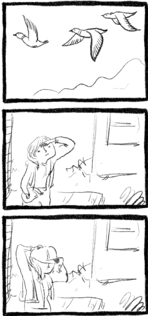
Figure 5: Three panels from Part One of "Ducks" by Kate Beaton.