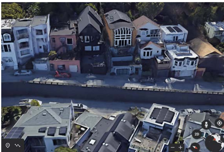
Figure 2: Google Earth view of C.S. Powell's San Francisco street.