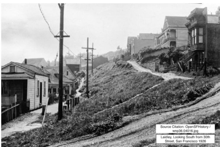
Figure 3: Archival photo of C.S. Powell's street.