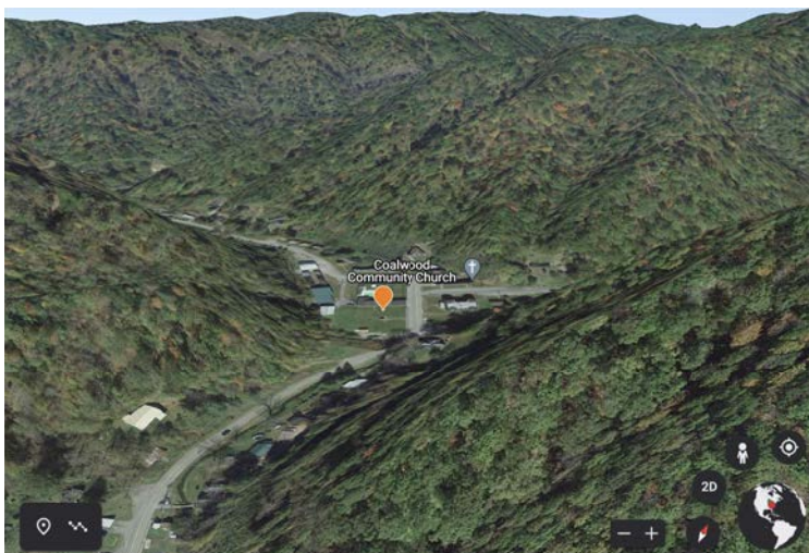
Figure 1: Google Earth view of present-day Coalwood, West Virginia.

ical readers: mere spots on a map and with scant information about what they look like at ground level. More, such locations are less likely to be significantly different from their 1920s versions, and may provide a more genuine construction of past reader contexts. However, their exclusion can also be viewed as representative of the tradition of rewriting, or erasure of the narratives of these communities, and in the case of Readers Worlds and its examination of pulp fiction readers, the disregard for their significance as an important element of the periodical reading community.