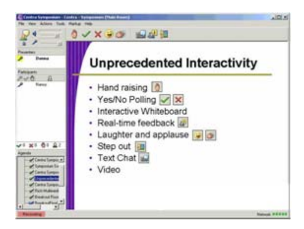
Figure 1. The Centra 6 participant interface

Learning Management Features: Centra 6 contains a basic learning/ content management (LCM) tool. These features are expected to expand in Summer 2006, following the acquisition of Centra Software by Saba Software . New versions of Saba and Centra will be released containing integrated LMS/ LCMS and online delivery solutions. In its present form, Centra also integrates with other leading LMS products.