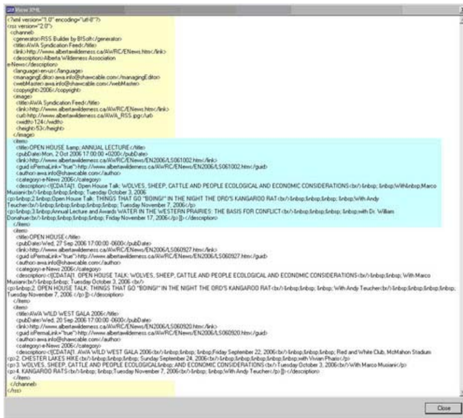
Figure 3. The XML preview window in RSS Builder displays machine readable format created from field entries in Figure 2. The XML highlighted in yellow represents then channel fields from the left area displayed in Figure 2. The XML highlighted in blue represents the first item fields from the right area displayed in Figure 2. Figure 1 is the resultant presentation for the end-user.

My recommendation is to choose the RSS editor that suites your taste. If you prefer an ASCII editor to produce the output in Figure 3, for eventual display in an RSS feed (as in Figure 1), then bon courage. For myself, however, I will stay with RSS Builder as long as it continues to be updated. The author seems to be very conscientious in responding to my inquiries in a timely manner (always a good sign). There appear to be a few other possibilities on the horizon for RSS editors, but I leave that for another discussion.