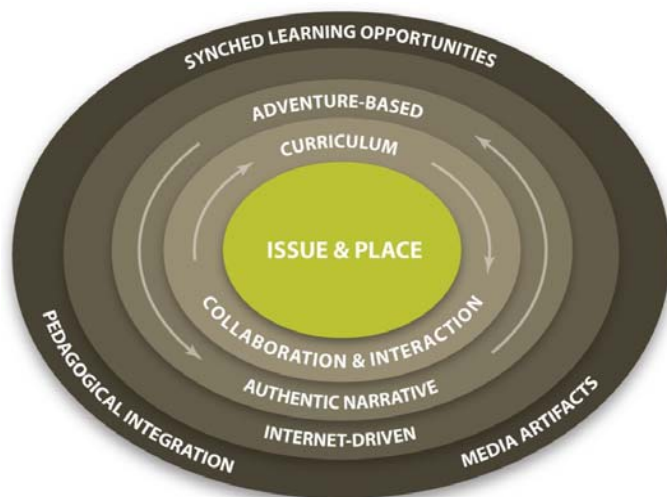
Figure 1. The second iteration of the adventure learning model: AL 2.0 (from The Learning Technologies Collaborative, in press).