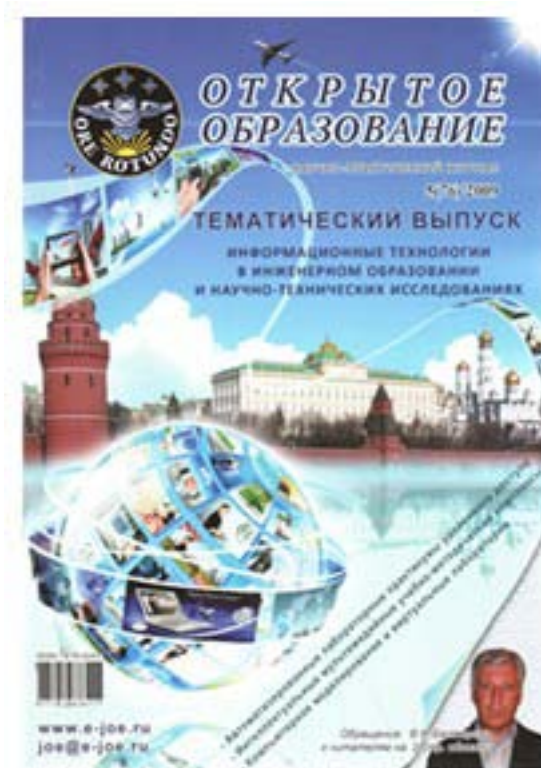
Figure 3. Journal cover of Open Education (2009).

Within the Russian literature the term distance education is similarly discussed but conceptually isolated from the older term correspondence education (cf. Ovsyannikov & Gustyr, 2001). This distinction is for example adopted by the Russian journal Open Education (Открытое образование), which can be regarded as equivalent to the prominent British journal Open Learning , yet the Russian version employs a greater focus on technological aspects of online distance education. Open Education was first released in 2002 and is published by MESI.