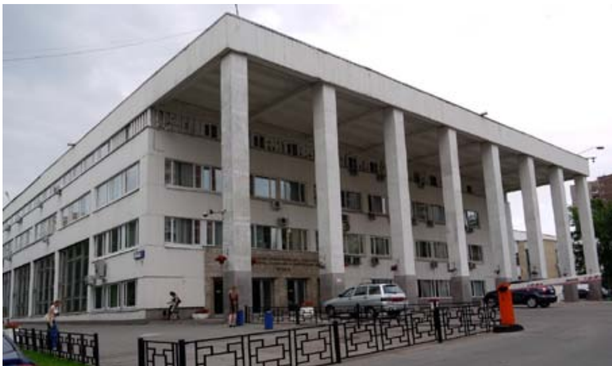
Figure 1. Main entrance of MESI at the campus in Moscow (Source: private photograph, June, 2010).

With the introduction of internet-based learning and teaching in 1992, MESI was one of the first to do so. Today MESI counts a total of 109,700 registered students, of which 9,200 are face-to-face students studying at the campus in Moscow. The average age of the students is 24; 63% of the students are female and 47% are male (October, 2010). Although its headquarters is located in Moscow, MESI operates another 37 regional centres and branches at higher education institutions all over Russia, which can be compared to the system of study centres/regional centres at other distance universities, such as the FernUniversität Hagen in Hagen or the British Open University in Milton Keynes.