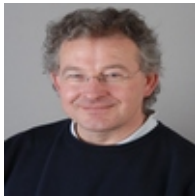
F.H.T de Langen Open University, The Netherlands