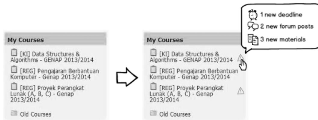
Figure 3. Recent activities information in course page

The recommendations regarding the moderate problem include: elements positioning based on their importance; addition of document and post tagging and searching feature; and addition of the recent activities information in course page. First, there were difficulties to access some important features that can cause the students to miss some important information. This research suggests the elements that are more frequently needed and/or considered more important should be placed on top of the page, while others should be placed below. Second, tagging and searching features are important to keep the information on track. Tag keywords could be topic information or course name. Forum posts and documents are learning artifacts that are recommended to have tag information, alongside with search feature. Third, based on the interviews, the recent activities information can appear as notifications that consist of the latest unread forum posts, updates on assignment or quiz information, and updates on course materials. It is also recommended to add subscription feature on particular discussion forum (see Figure 3 below).