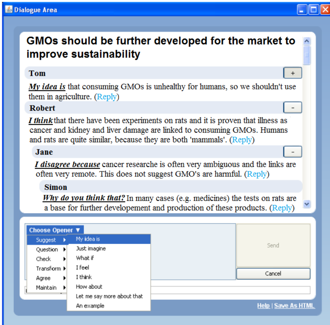
Figure 1. A screenshot of the digital dialogue game with associated sentence opener.

free discussion board (for example McAlister, Ravenscroft, & Scanlon, 2004; Ravenscroft, 2011; Ravenscroft & McAlister, 2006).