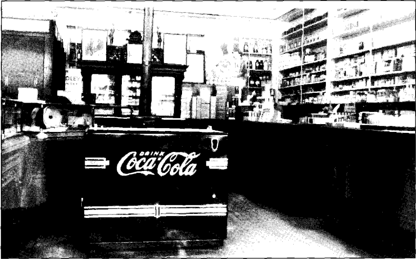
Interior of Field's Drug Store (n.d.), showing signs of the wide variety of products for sale inside.

Even residents who did not particularly care for the town's old buildings were conscious that they had economic value. When an upswing in prosperity after the Second World War brought new development pressures into play, the local establishment began looking for ways to protect the traditional character of the town. 2 A Town Planning Board meeting on February 5th, 1962 proposed the creation of a new organisation that could act to preserve local heritage. It took some lobbying at Queen's Park, but the Niagara Foundation was chartered under provincial legislation in 1962. Its first president was the town's mayor. 3