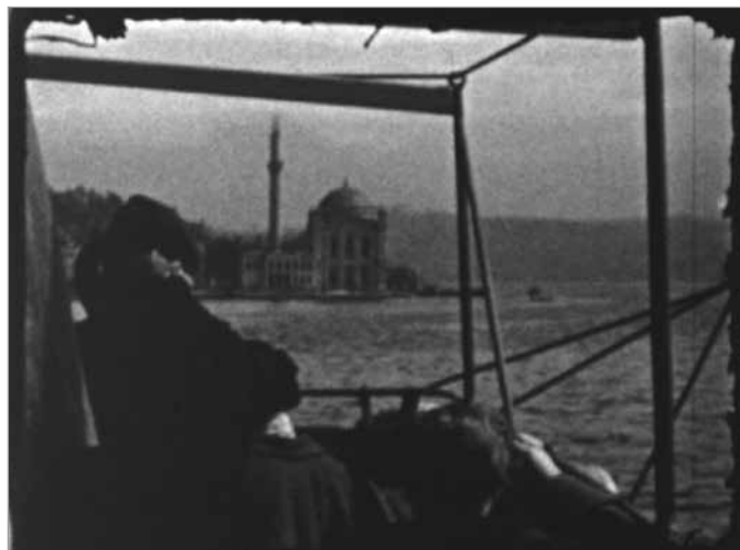
FIG. 6. FROM THE BOAT TRIP ON THE BOSPHORUS, TOWARD ORTAKÖY MOSQUE. STILL FROM HOME MOVIE.