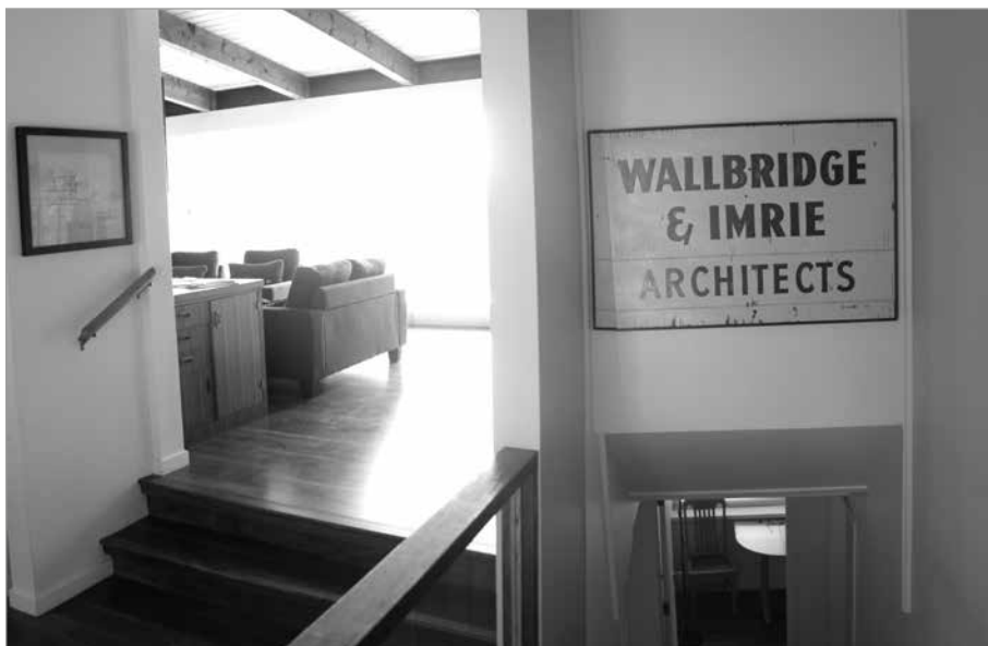
FIG. 4. THE PLATE INDICATING THE OFFICE DOWNSTAIRS. IT IS THE FIRST THING ONE SEES UPON ENTERING THE HOUSE. THE PHOTOGRAPH IS TAKEN FROM THE ENTRANCE DOOR; TO THE LEFT IS THE LIVING ROOM. | IPEK MEHMETOĞLU.

that defined the American “road trip.” 40 The trip and the book that came after, On the Road , have since been viewed as characterizing a postwar American mobility to escape tradition and society in a completely masculine fashion. 41