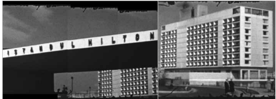
FIGS. 8 A-B. ISTANBUL HILTON HOTEL, DESIGNED BY SOM IN 1955. THE HOTEL AND THE MUNICIPALITY BUILDING ARE CONSIDERED THE FIRST TWO EXAMPLES OF INTERNATIONAL STYLE MODERN ARCHITECTURE IN TURKEY. STILLS FROM HOME MOVIE.