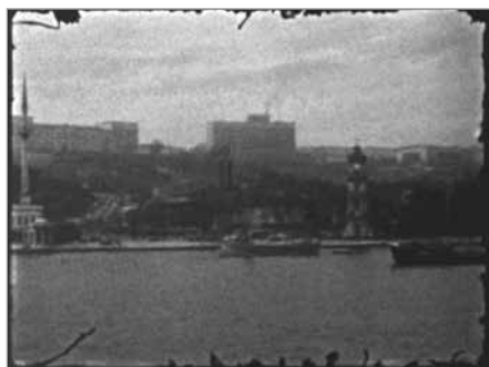
FIG. 9. HILTON HOTEL SEEN FROM THE BOAT. STILL FROM HOME MOVIE.