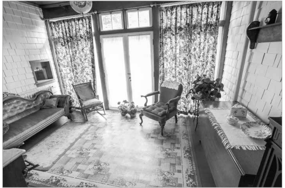
FIG. 14. THE SUN PARLOUR IN THE WYATT HISTORIC HOUSE MUSEUM.