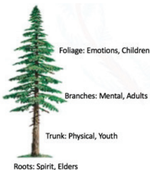
Figure 1: Cedar Project Terms of Reference. Image reproduced with permission of Cedar Project Partnership.

Terms of Reference (Figure 1) in all phases of the research, as part of their commitment to reciprocal accountability.