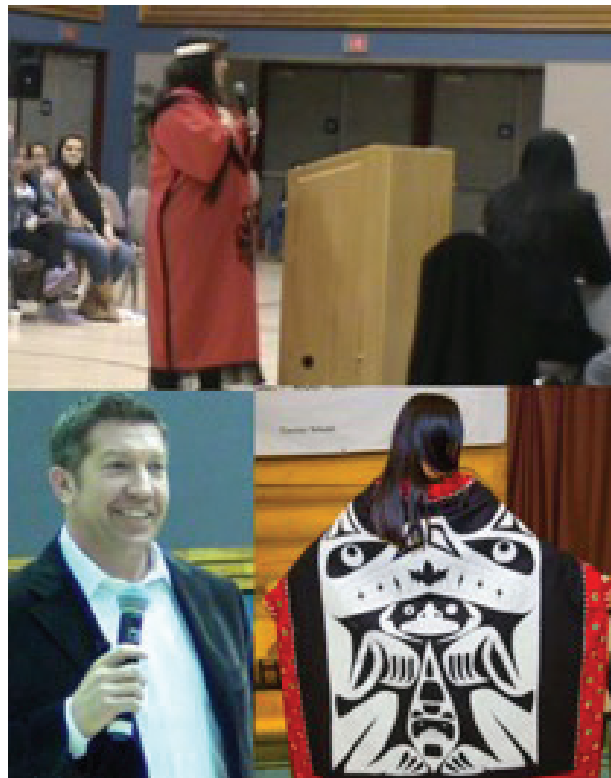
Figure 5: Cedar Project Potlatch, 2013.

Cedar governance is the face and voice of Cedar research. Cedar Project Partnership governs us through all knowledge translation, including print, TV, and radio press. The Partnership determines release of findings to the media, emphasizing community relevance, reciprocal responsibility, and privileging Indigenous