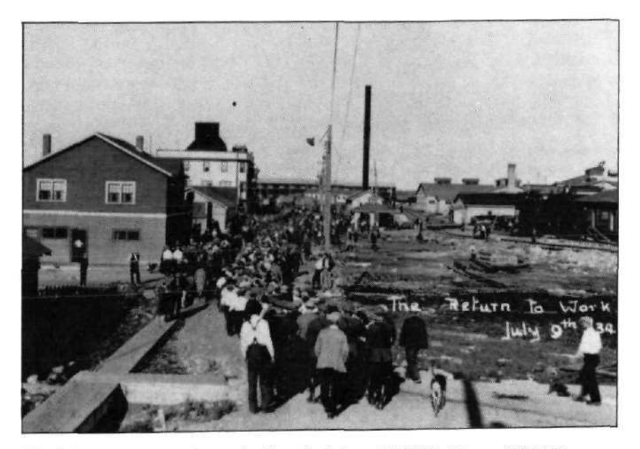
The 9 July return to work march. Note the helmeted RCMP officers.

On 14 July, the strike committee finally succumbed to the inevitable and voted 201 to 18 in favour of ending the strike.<sup>116</sup> In a last ditch effort to prevent discrimination against union members, the committee addressed a telegram to the Department of Labour asking for government arbitration. Complaining that 107 men had been discriminated against, the local branch of the MWUC requested the establishment of a Board of Arbitration to investigate miners' claims.<sup>117</sup> The Deputy Minister of Labour replied that it was impossible to set up a Board of Arbitration because the Industrial Disputes Investigation Act clearly did not apply to men who were no longer in the employ of the company.<sup>118</sup> With its leaders awaiting trial, its forces cut down by more than 75 per cent, the mine in operation, and the refusal of government arbitration, the local branch of the MWUC had its last hope rejected.