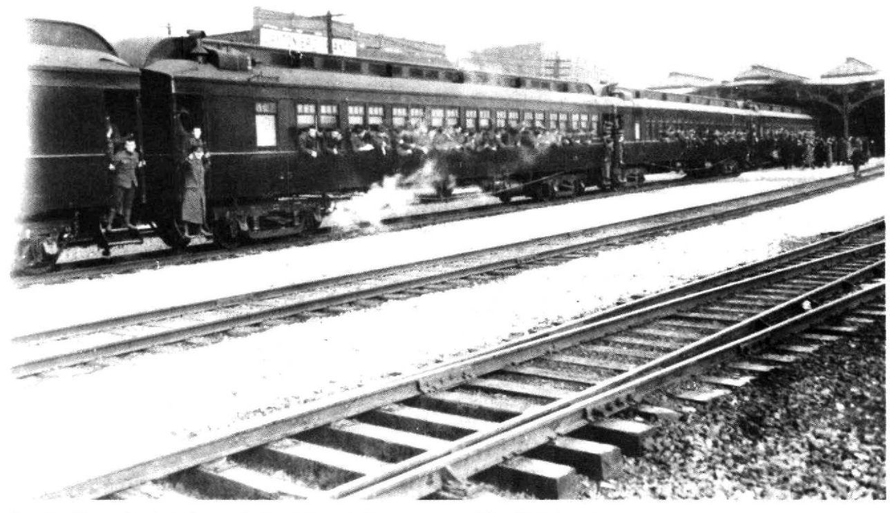
Canadian Troops leaving Windsor Station, Montreal.