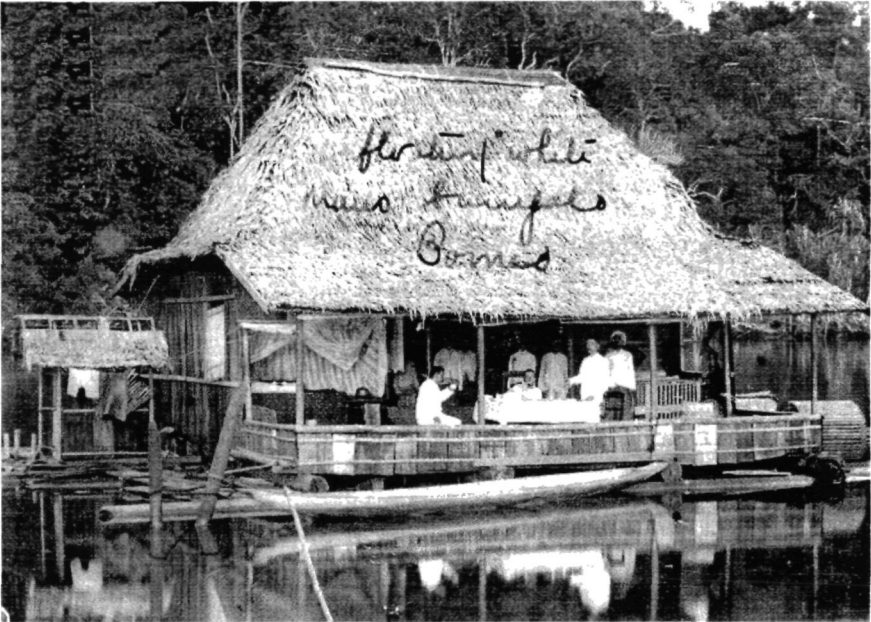
Figure 1. Enniskillen Drillers' Bungalow in Miri, Borneo.

dismissed for insobriety or gross misconduct, the company was entitled to recoup its losses from the Retention Fund. 54