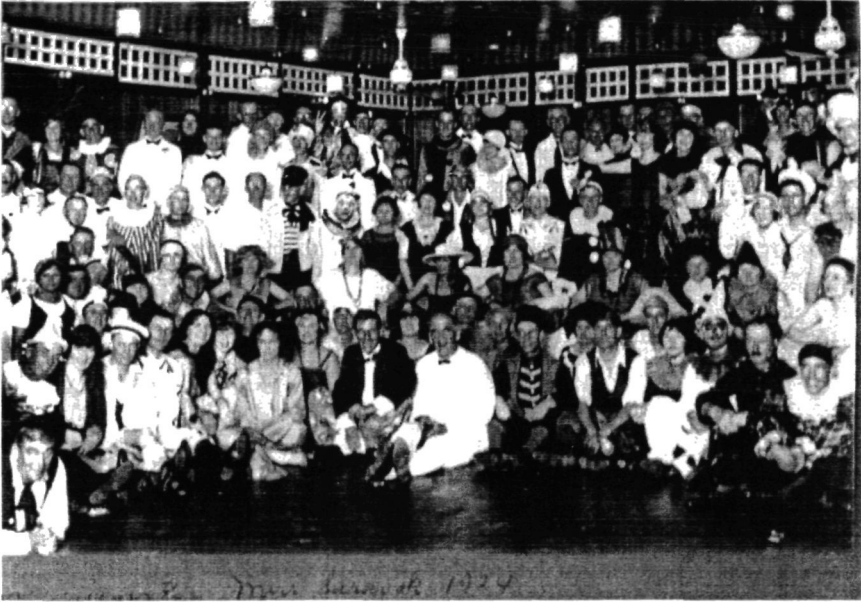
Figure 3. New Year's Eve Celebration at the Company Club in Miri, Borneo, 1924.