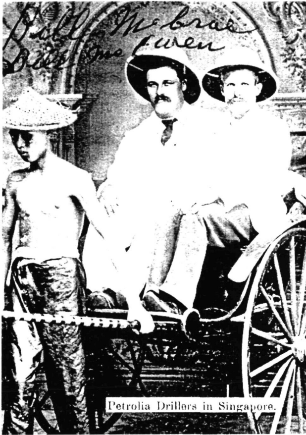
Figure 4. Petrolia Drillers in Singapore.

eign drillers” continued to manage expenditures for household consumption in the absence of their husbands.