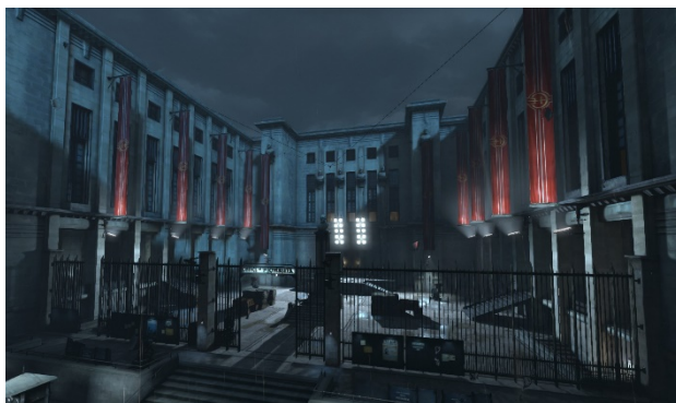
Figure 1 - The Office of the High Overseer