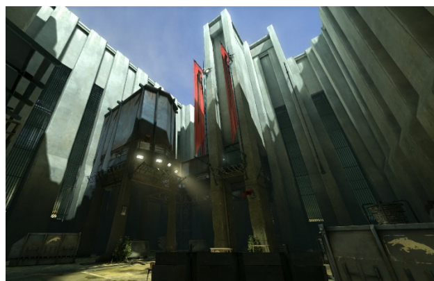
Figure 3 - An Internal courtyard of Coldridge Prison