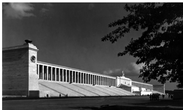
Figure 2 - The Zeppelin Grandstand, designed by Albert Speer, a part of the Nuremberg Rally