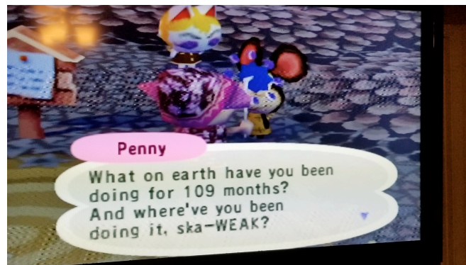
Figure 2 – A player is asked a perfectly reasonable question.

guilt the player for not playing for long stretches of time (see Figure 2 ). In an interesting reversal of the idea that one can never quite ‘turn off’ from their working life, in Animal Crossing , one is altogether incapable of ‘turning off’ the game’s monitoring of their play.