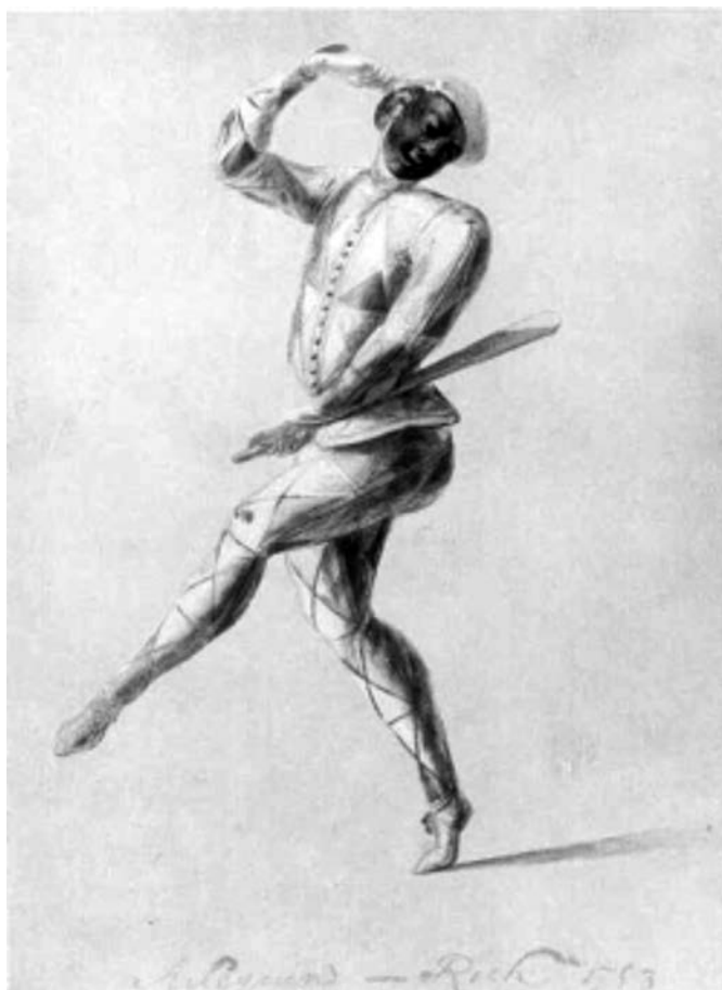
Illustration 2: John Rich in 1753. Artist unknown.