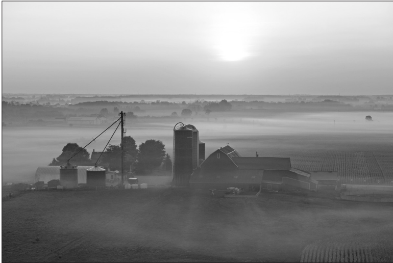
Fig. 3 The traditional pack barn is disappearing in much of Ontario, but Mennonite mixed farming practices mean they are still very much needed in rural Waterloo. Many farmsteads also have ancillary facilities to support small industries such as woodworking shops and metal fabricators.

include methods for not only identifying valuable, character-defining landscapes, but also for offering them a measure of protection from unsympathetic change in the land-use planning regime.