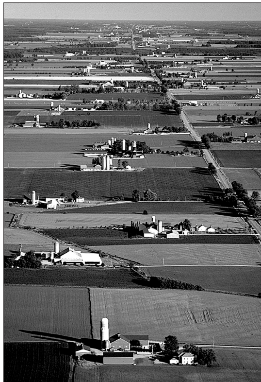
Fig. 1 The Waterloo countryside that is home to a largely Mennonite population is still typified by mixed farming practices and the family-based settlement pattern that supports that form of agriculture.

The Old Order Mennonites and their unique culture contribute to the landscape of the Waterloo Region and increase the tourism appeal of the area. Tourists come to the Region to glimpse a lifestyle that, in the technology-dependant 21st century, is an anomaly. The importance of Old Order Mennonites to tourism in the Region is easily confirmed by the use of Mennonite images in marketing for the area. To date there has also been an appropriate commercial interface in which products created by the Mennonite community, ranging from quilts and quality food to furniture and wooden windows, are sold to local residents and tourists. There is, on the other hand, a constant threat to the viability of the Old Order life style from exploitation and inappropriate development. McIlwraith (1997) has warned that the Mennonite landscape is threatened. He pointed out that in 1994 a meeting house had been closed because suburban traffic was too dangerous and that Mennonites were beginning to move away because of such encroachment. There