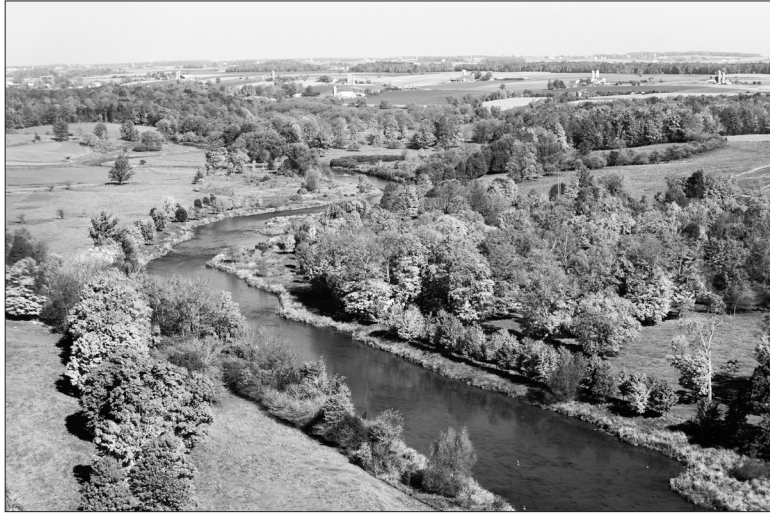
Fig. 4 The Grand River and its tributaries traverse the Waterloo countryside and a considerable portion of the land is occupied by woodlots that supply a sustainable yield of lumber and heating fuel.

in 1992 but which has undergone a number of modifications since that time.