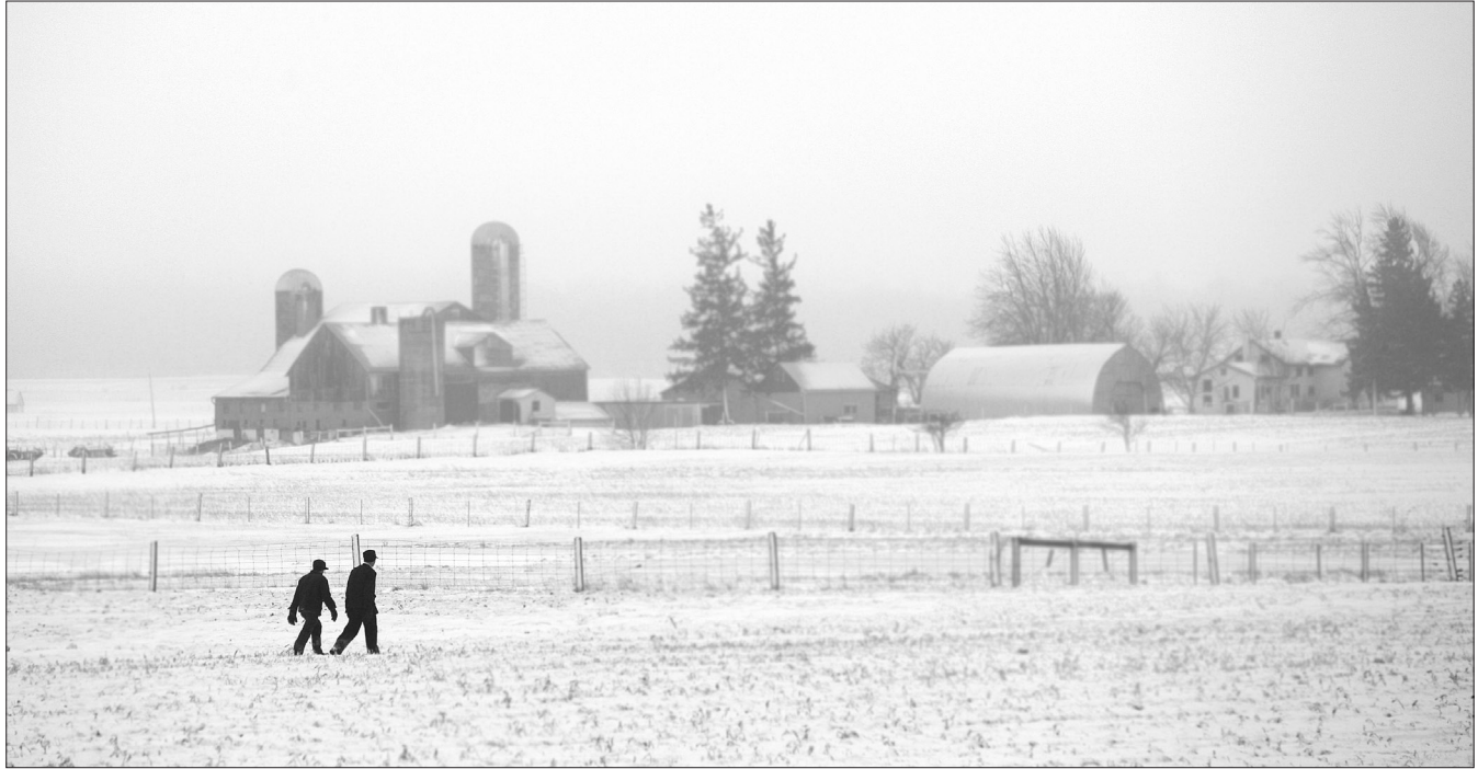
Fig. 5 The land use pattern in rural Waterloo supports close knit communities.

Island Trust do not have to seek re-election by constantly promising lower taxes achieved by attempts to increase the tax base at the expense of land conservation.