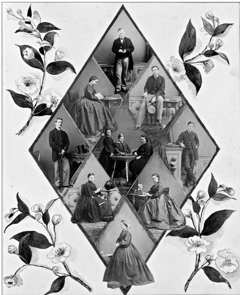
Fig. 1 Frances Elizabeth, Viscountess Jocelyn (English, 1820–1880); Diamond Shape with Nine Studio Portraits of the Palmerston Family and a Painted Cherry Blossom Surround; from the Jocelyn Album, 1860s Collage of watercolor and albumen prints; National Gallery of Australia, Canberra.

exhibition marks the first time that many of these albums have been on public display.