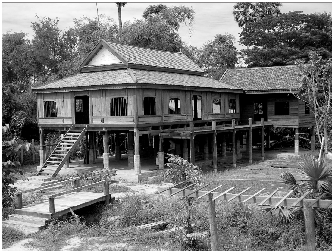
Fig. 8 The wooden house in Spean Chreav four months after the column raising ceremony.

projects and value both the aesthetics of a wooden house and its cultural significance to Cambodia's built environment. They also have the financial means to purchase land and build a house designed by an architect who works with highly skilled craftsmen. While some of their houses have been historic preservation projects, others have been new constructions that rely upon the designs and materials that are characteristic of the wooden house. These clients, however, are not interested in merely duplicating a house from the past, but expect modern upgrades that include indoor plumbing, electricity, septic systems, kitchen and bathroom counters, closets and even landscaping. Such demands require Hok Sokol and members of his architectural firm, HHH Company, to design innovations that are rooted in understanding the vernacular wooden house, while at the same time making it accessible to a current clientele. 14