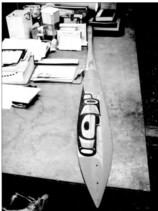
Fig. 12 Paddle, Curatorial Department, AMNH.

today hung from the entrance ceiling, minus the plaster occupants.