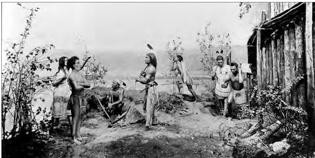
Fig. 5 Return of the Warriors, op. cit.