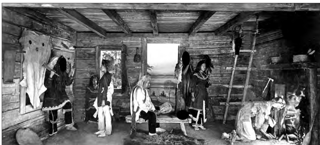
Fig. 3 The False Face Ceremony, op. cit. © NYSM The masks were repatriated and were blacked out in the pictures at the request of the Iroquois Nation.