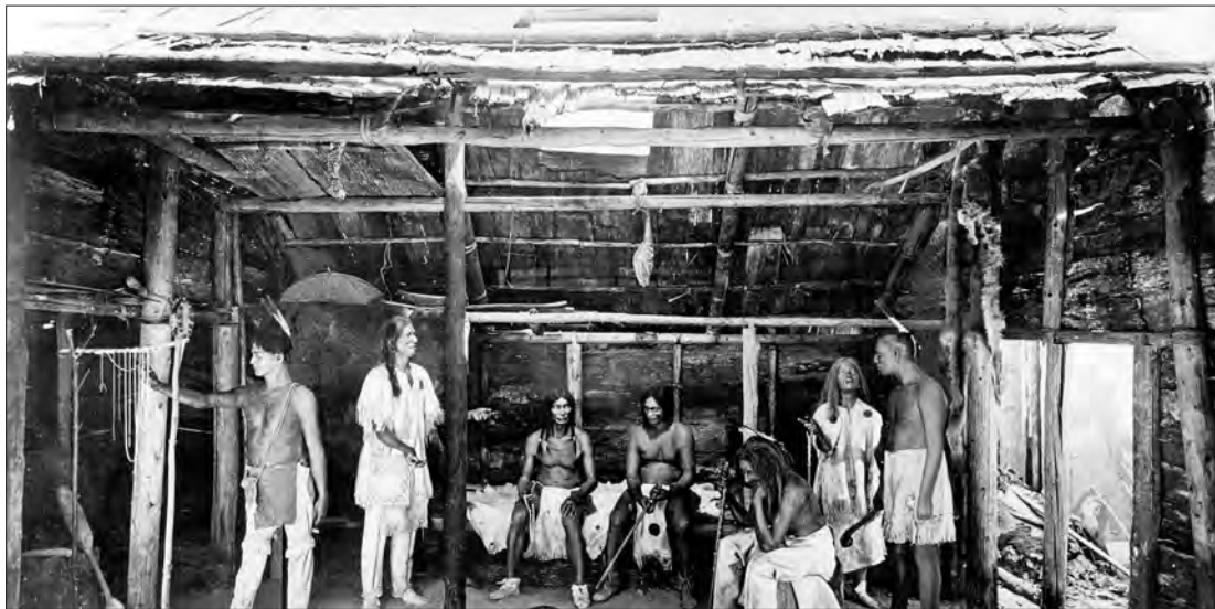
Fig. 4 A Council of the Turtle Clan, op. cit.