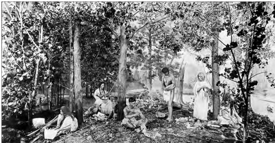
Fig. 2 Iroquois Industries, op. cit.