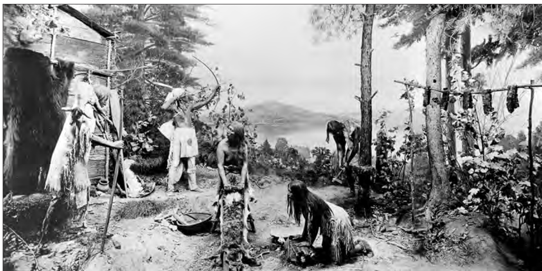
Fig. 6 Hunting Group, op.cit.