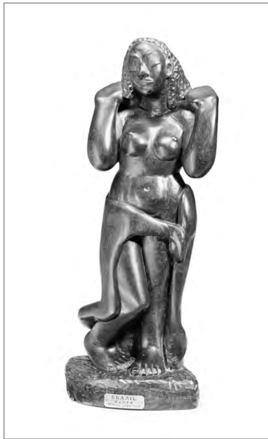
Fig. 3 Maria Martins, Samba , Jacaranda, unknown date, I.B.M. Collection ( Art News , January 15-31, 1942, 19).

Maria’s sculpture and its reception by the surrealists created a dialogue on freedom from many different perspectives: political liberation from colonialism, freedom to experiment with new sculptural form, rebirth and transformation in the face of the horrors