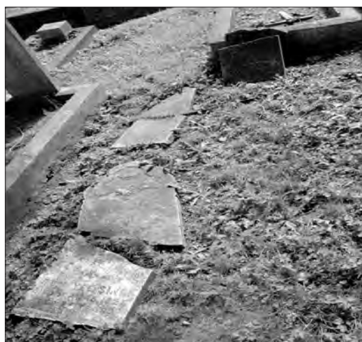
Fig. 3 Fragments of headstones belonging to three Chinese graves.

A few inscriptions on the headstones are legible (see Fig. 4, 5, and 6 for example), while some are difficult or even impossible to identify completely. From the twenty-three dates of death we were able to collect, we determined that the basic sequence of the burials runs from grave 26 (April 2, 1922) to grave 1 (October 12, 1942). With this order in mind, the original locations of the fragments in the bottom left-hand side can be surmised. The fragment with the date of death of August 14, 1922 probably belongs to grave 18, and the other fragment with the date of May 15, 1929 was likely originally on grave 22. In the same way, we inferred that marker 27 should be on grave 7. The fragment of stone without a date bears the name of the deceased, Gong Kee. Since there is only one unmarked plot left, it is very probable that it is from grave 13. Therefore, although the information available for each headstone varies, we have been able to identify all twenty-five graves and their respective headstones. Building on the premise that mortuary studies can provide