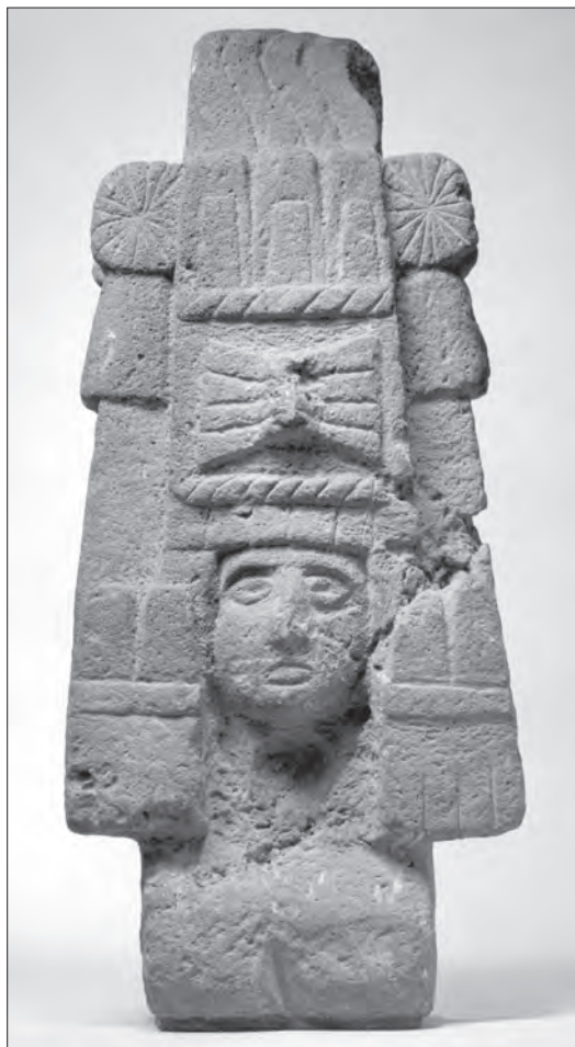
Fig. 7 (left) Chicomecoatl's large paper headdress, amacalli , which is consistent across depictions such as this statue. Note that she holds the double ear of maize in both hands. The Metropolitan Museum of Art, accession no. 00.5.28.