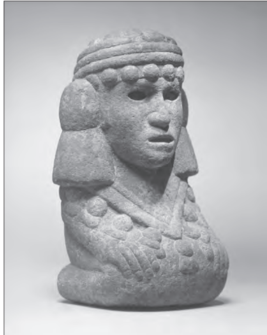
Fig. 3. Stone statue of Chalchiutlicue, goddess of streams, rivers and lakes. Metropolitan Museum of Art, accession no. 00.5.72.

Adding to their similarity, all six statues and the WAM fertility goddess are adorned with a wreath of five to seven flower blossoms around their foreheads, a feature rare in most Aztec fertility goddesses (Nicholson 1963: 16). However,