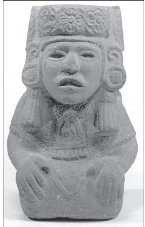
Figs. 2a, b (below left) c, and d (below, right) Group of Aztec statues of fertility goddesses comparable to the WAM statue: a. Museo Nacional de Antropología, Mexico City (no. 11.0-02997;); b. Head of Xilonen, the Goddess of Young Maize, 1400-1500, The Art Institute of Chicago no. 1986.1091 (note two vertical bars carved on each cheek); c. Metropolitan Museum no. 1979.206.1386; d. Metropolitan Museum no. 1979.206.407. Note also that a, c, d are carved on the back or top of the head with the calendrical name "7 Serpent" (Chicomecoatl).