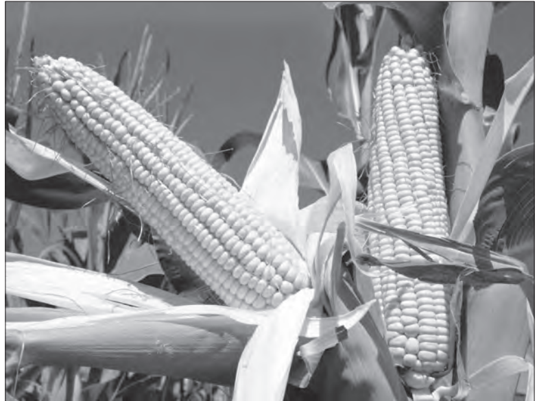
Fig. 6c (above)

Nevertheless, the close link between Xilonen and Chicomecoatl is brought to life in that three of the seven statues in this group are carved with the calendrical name "Seven Serpent" or