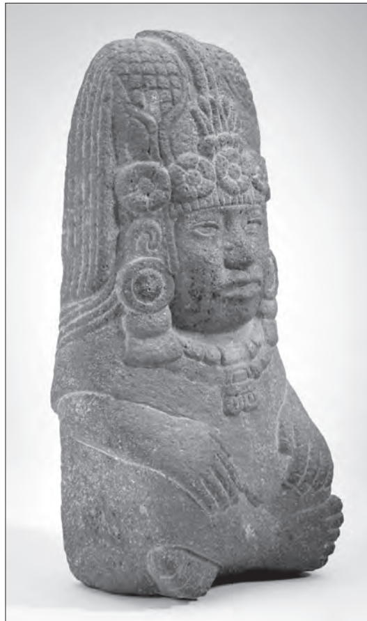
Figs. 1a, b, c (opposite) The Worcester Art Museum's Fertility Goddess, 1450-1521, accession no. 1957.143

The statue's most elaborate part is the head and headdress. This is not surprising, since