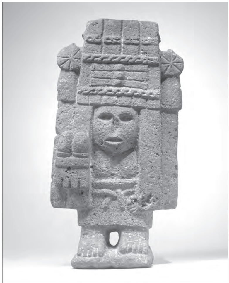
Fig. 4 (below) Stone statue of Chicomecoatl, goddess of mature maize. Note the two corn cobs held in her right hand. Metropolitan Museum of Art, accession no. 00.5.51.