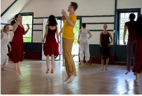
Figure 1 Mariam Ghani and Erin Ellen Kelly, Jump from the series When the Spirits Moved Them, They Moved , 2019. Dye transfer print on dibond. (c) Mariam Ghani & Erin Ellen Kelly; Courtesy of the artists.

As I entered the dark gallery displaying the artists' three-channel video, I also encountered three wooden benches set up on the gallery floor. The benches provide a physical counter to the three, two-dimensional projections illuminating the wall opposite the entrance. The video's horizontal arrangement evokes a triptych, accentuated by the artists' decision to project the same footage, flipped horizontally, on each of the two outside channels. "The symmetrical format of the 3-channel installation," Ghani explains on her website, "refers to the highly symmetrical gift drawings produced by Shakers as depictions of the visions received during these meetings" (2019).