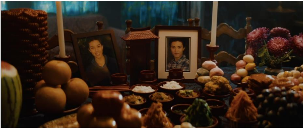
Figure 4: "Edward's photos are on the alter (3:08) in Koreatown Ghost Story ."

dying Ms. Moon, this missing reference to the ancestors uncovers a visual absence, disrupting the kinship lineage, thereby derailing the Moon family in its patrilineal trajectory to maintain the kinship inheritance. The film renders a future built on the ghost marriage, thereby binding the potential with haunting by all ghosts (Edward, as well as the unexplained ghost dressed in Hanbok appearing in the kitchen) in Ms. Moon's house. The haunting in the future thus releases an anxiety associated with this upcoming alternative space-time, which reveals the subject as an improper temporal being, challenging a "proper" temporal relation to the linear past-present-future framework.