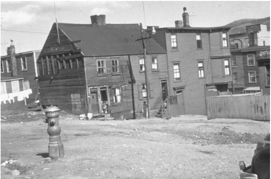
Stephen Street, 1952.

During the summer of 1942 four students from Memorial University College distributed questionnaires to the households of St. John's, asking for details of their