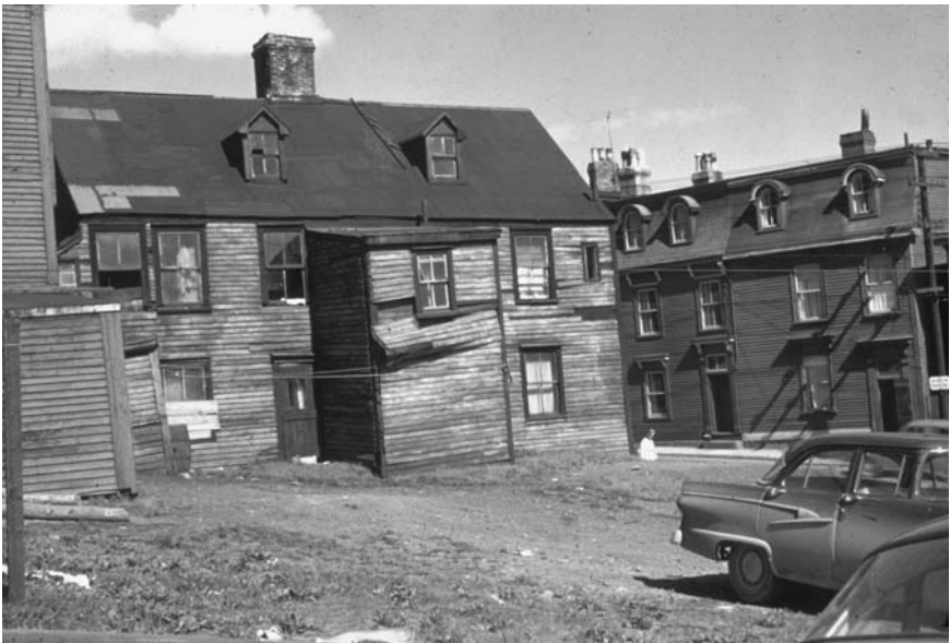
Bottom of Carter's Hill, 1952

We must accept the indictment that we have tolerated in our midst conditions that are a disgrace to our personal and civic pride and to our humanitarian instincts.... This report and all the effort that has gone into the drafting of it can be an historic document or a waste of time. If it should prove to be the latter we shall condemn ourselves as a selfish, apathetic community deserving of all the ills that may befall us. (Wayfarer 1943)