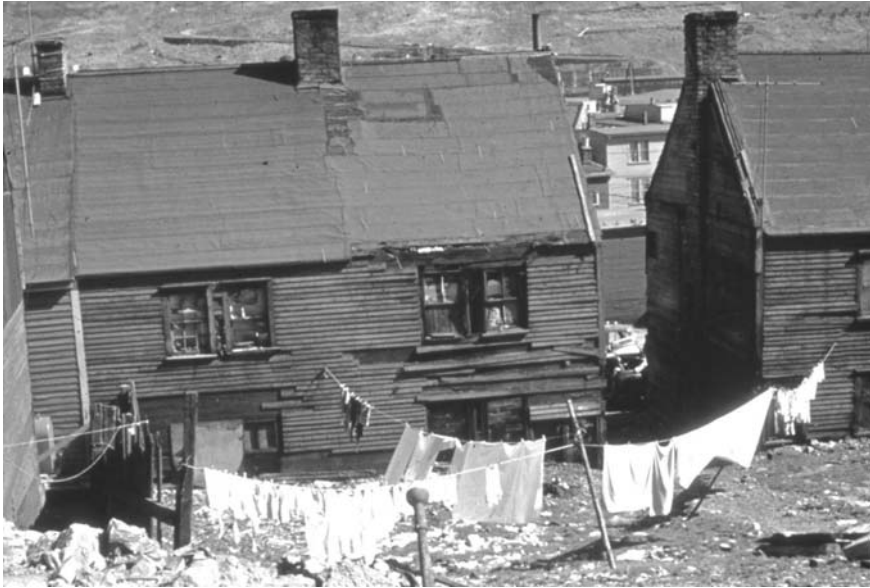
Duggan Street, 1952 (Stanley Pickett).

all adequately provided with modern conveniences and available on the hire-purchase scheme.... The Housing Commission merits the grateful acknowledgment of its painstaking efforts and courageous and constructive report. ( Daily News 1943a)