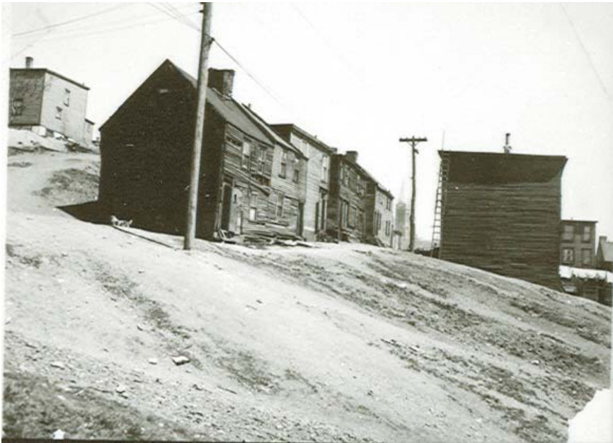
Moore Street, 1951 (City of St. John's Archives).

of Canada, and the infant mortality rate double (Baldwin and Poulter 2005: 284). The cause, according to the Commission, was the poor state of the houses and neighbourhoods in which the poor lived: "In a large number of cases these people are living in condemned or condemnable houses, not because they cannot pay for or do not want something better, but because nothing better can be had. The breakdown of private enterprise, the stranglehold of closely-held land and the absence of local transportation facilities all play their part in this situation" (CEHTP 1943b: 15).