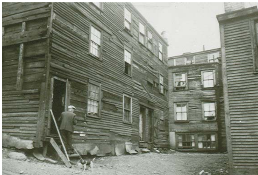
Notre Dame Street, 1950s (City of St. John’s Archives).

A section of the report entitled “The Slaughter of the Innocents” pointed out that the five-year average infant mortality rate in the city, at 96 per 1,000 live births, was higher than that in Ireland, Canada, Germany, England, and New Zealand. Other observers also noted the deplorable state of public health in the City. Mona Wilson, the Canadian Red Cross Assistant Commissioner for Newfoundland between 1940 and 1945, noted that Newfoundland’s tuberculosis rate was triple that