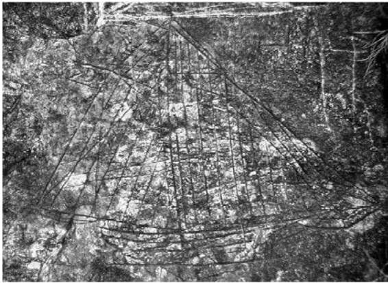
Figure 3. Rupestral engraving at the Dorset quarry site of a vessel resembling an eighteenth- or nineteenth-century French chasse-marée .