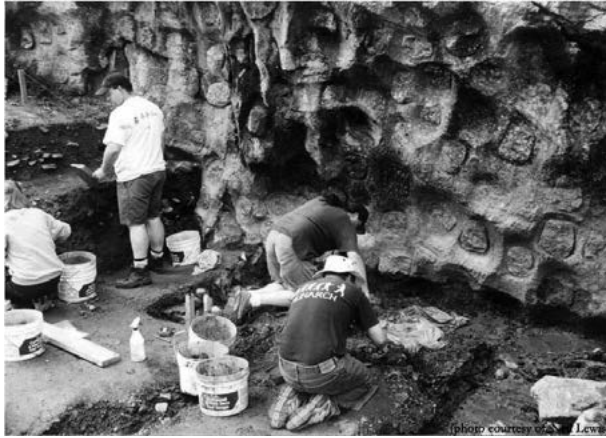
Figure 2. The Dorset soapstone quarry, in Fleur de Lys (EaBa-01).