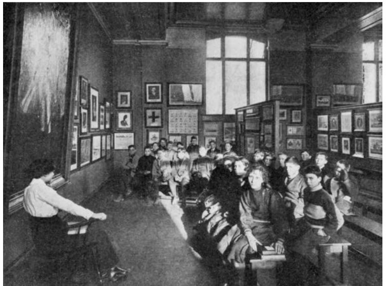
"The 'Story Hour' in the Public Library," Globe 12 April 1913. Photograph taken in the J. Ross Robertson Picture Gallery, lower level of the Toronto Public Library, College and St. George Streets.