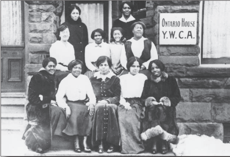
The next generation of African Canadians in Toronto carried on the tradition of activism. This Collingwood group is posing in front of the Toronto YW.C.A.

chicken and watermelon.” The woman responded that that was the most insulting thing he could say to someone of African origin. 53