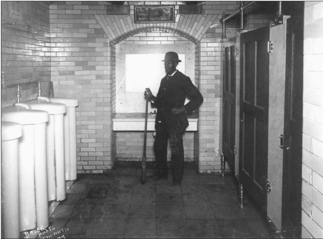
Blacks in Toronto in the 1880s were often confined to low-skill occupations in service-oriented jobs such as this public washroom attendant.