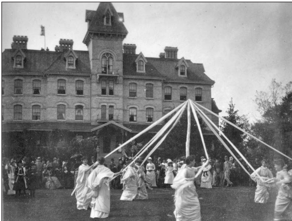
Figure 7: May Day Festival (Julian Seavey, c.1884-5)

their erect carriages, severe hairstyles and control of the horse. The visual juxtaposition is most marked in the pairs of figures at either end of the frame: on the far left the white dress of the girl holding the bridle shines against the trees and dark skirt of the mounted rider behind her, and on the right the masculine-style headgear of the mounted rider is sharply delineated in the centre of the negative space of the sky. The two groups have an uneasy relationship—will the three mounted girls climb down and join their fellow rider in the centre of the frame? The profile of a