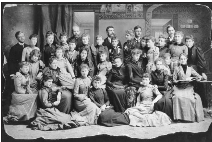
Figure 4: Studio Photograph of Hellmuth Students and Teachers (Unsigned, c. mid-1880s)