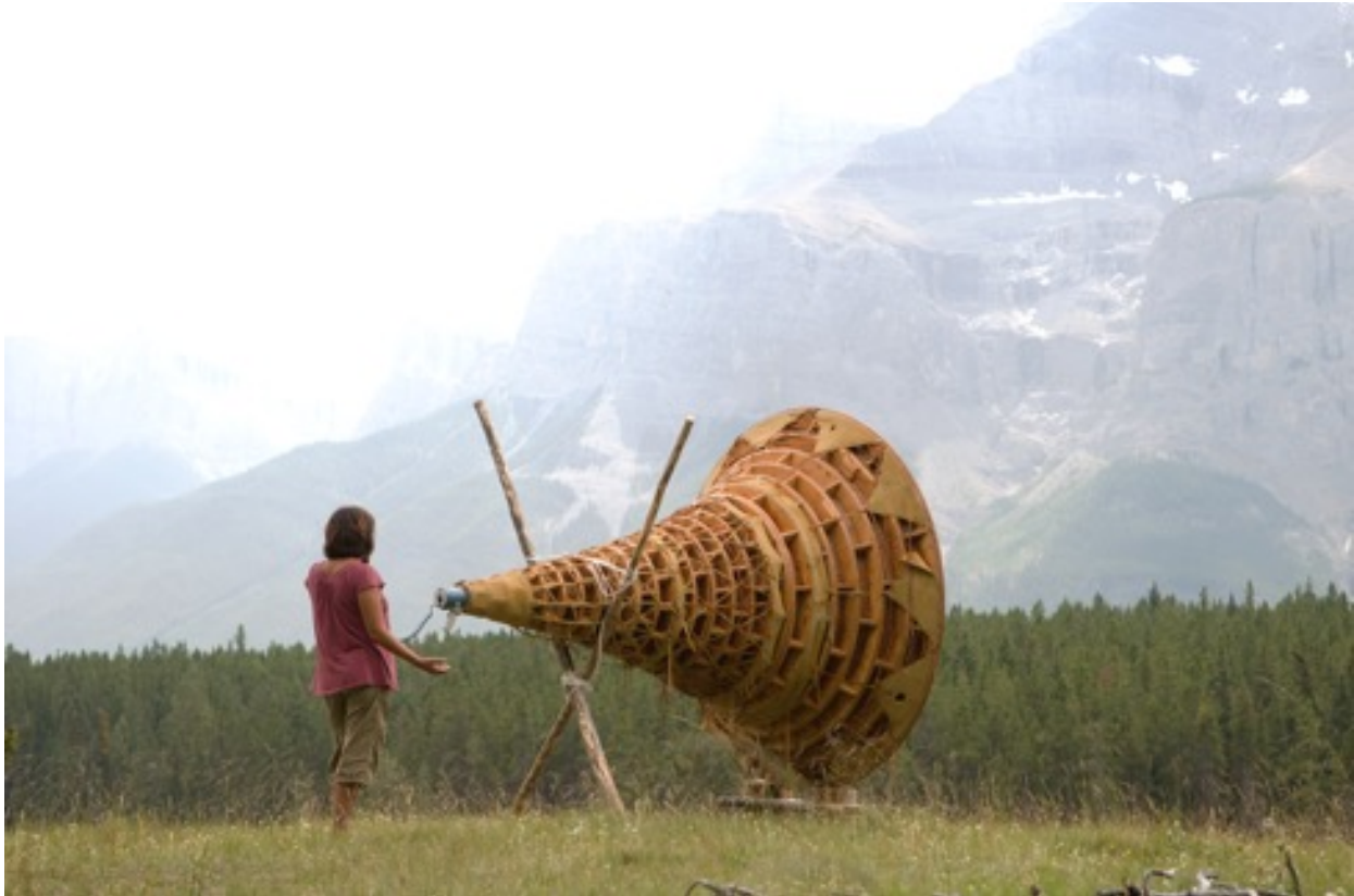
Rebecca Belmore, Ayum-ee-aawach Oomama-mowan: Speaking to Their Mother (1991). Gathering, Johnson Lake, Banff National Park, Banff, Alberta, July 26, 2008. Presented by the Walter Phillips Gallery as part of the exhibition Bureau de Change, July 12–September 28, 2008. Purchased with the support of the York Wilson Endowment Award, administered by the Canada Council for the Arts. Accession #P08 0001 S.

In an image from Wave Sound (2017), a person kneels on the grass at Green Point in Newfoundland, Canada, listening through a large aluminum cone directed toward the body of water below the cliff. Located on Mi'kmaq land, Green Point was incorporated into the settler state as Gros Morne National Park in 1973, following Newfoundland's 1949 confederation with Canada. While Ayum-ee-aawach Oomama-mowan had not previously been performed at Green Point, it had been performed on Mi'kmaq peoples' lands during the work's 1992 tour, when the megaphone was used on Citadel Hill in Halifax, Nova Scotia—a site where English settlers have maintained a fort since 1749 and where Parks Canada maintains a living history program that invites contemporary settlers to dress in costume, fire a rifle, and become a “soldier for a day,” per their website. While the Parks Canada program demonstrates how settler-colonialism relies on continual reperformances, the sonic returns staged by Belmore's two works on Mi'kmaq lands unsettle Canada's claim to possess these “national” spaces, resituating them as Indigenous lands. Especially since the context of Wave Sound's commissioning meant that the three aluminum listening devices were likely to be used primarily by non-Indigenous visitors to the national parks, Belmore shifted the vantage point from speaking to listening for the 2017 installations.