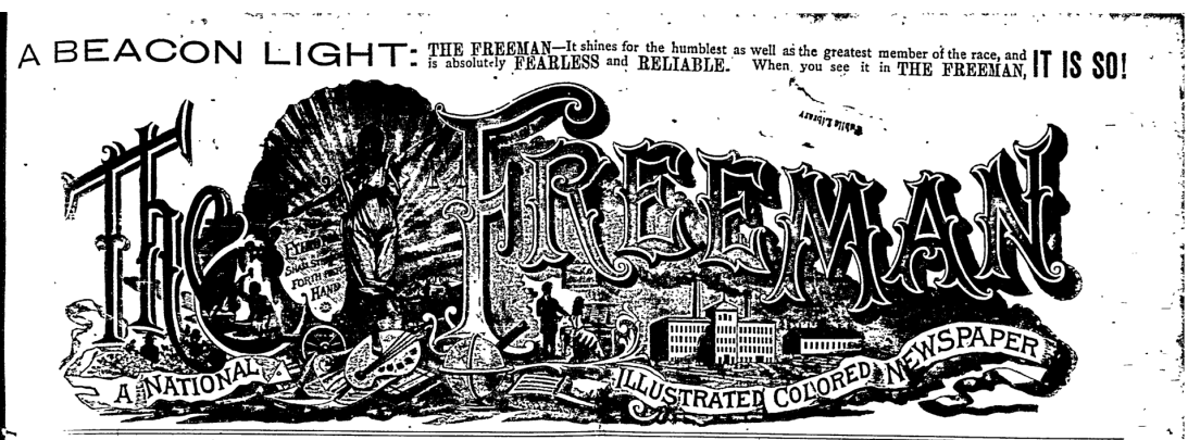
INDIANAPOLIS, INDIANA, MAY 4 1895.