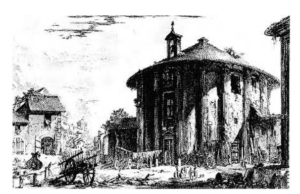
FIGURE 1. G.B. Piranesi, Temple of Vesta. From Levit.

The prints of Giovanni Battista Piranesi combined the archaeologist's passion for accurate observation with a love of grandeur, mystery, and fantasy. Herschel Levit chose forty-one plates by Piranesi, largely from his Vedute di Roma (1748 ff.), and photographed the same views in order to contrast eighteenth-century Rome with the contemporary city. The etchings and the photographs are reproduced side by side with comments by the author. They are introduced by a brief biography of Piranesi and notes on his style and methods of work.