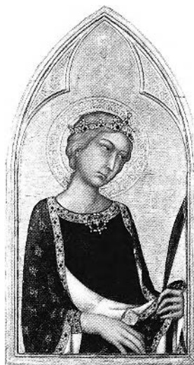
FIGURE 1. Simone Martini, St. Catherine of Alexandria, ca. 1320. Ottawa, National Gallery of Canada.