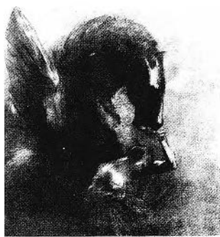
FIGURE 3. Odilon Redon, Pégase captif , 1889. Ottawa, National Gallery of Canada (Photo: National Gallery of Canada).