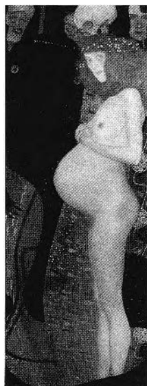
FIGURE 2. Gustav Klimt, Hope I, 1903, Ottawa, National Gallery of Canada.