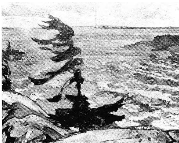
FIGURE 2. F. H. Varley, Stormy Weather, Georgian Bay, 1920-21. Oil on canvas, 132 × 162.6 cm. Ottawa, National Gallery of Canada.