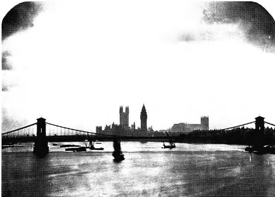
FIGURE 1. Roger Fenton, Houses of Parliament under construction. London, 1858(?).

States, Canada and France spoke on various topics: the photograph as part of the popular myth-making process; as a useful tool in architectural restoration and archaeology; and as part of recent campaigns such as the DATAR project in France, heir to the original 1851 Mission héliographique. Apart from simple problems of audibility due to the noise level of the simultaneous translation, the tone of the proceedings tended to be one of experts and initiates addressing one another rather than the general audience. One would have liked more discussion like John Szarkowski's about what constitutes 'good' architectural photography. Szarkowski contrasted the serendipitous 'Sunday' photographer of buildings with the professional whose 'Monday' shots are all in a week's work. Such an understanding – no doubt in part intuitive and oversimplified as presented by Szarkowski – was either not referred to at all or somehow taken for granted. Such issues so basic to an emerging area of scholarly interest must be continually defined and redefined. Nevertheless, the National Gallery is to be commended for the symposium and for distributing a sheet describing the technical photographic terms that can be so confusing to a novice. The glossary was available free of charge to visitors in the galleries.