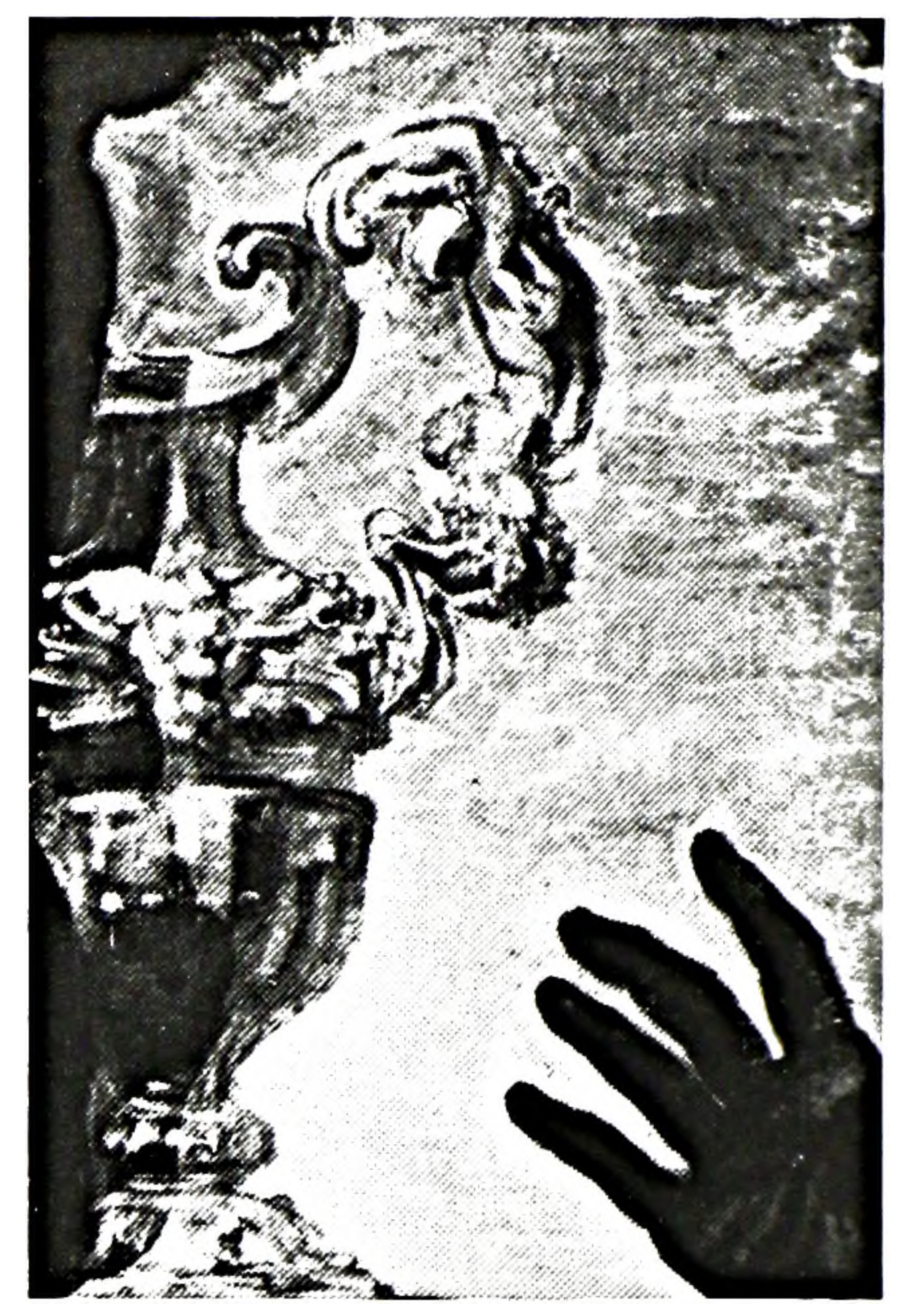
FIGURE 2. Samson and Delilah, detail of the wine ewer.

race. The blue sky can be clearly seen between the Philistine and the group of women, while the Philistine army cowers behind a massive pillar. This setting not only contradicts the story, it also undermines its credibility. Van Dyck places the scene within a building which makes little architectural sense (what function, for instance, does the column serve?) and, most importantly of all, this setting has the effect of dissipating much of the tension of the moment' (p. 34).