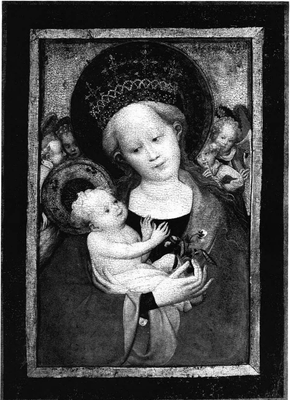
FIGURE 34. Anonymous, Madonna with the Flowering Pea , Ottawa, National Gallery of Canada.