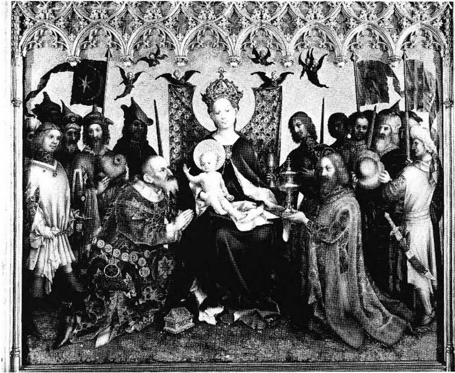
FIGURE 37. S. Lochner, Adoration of the Magi , centre panel, Cologne, Cathedral.