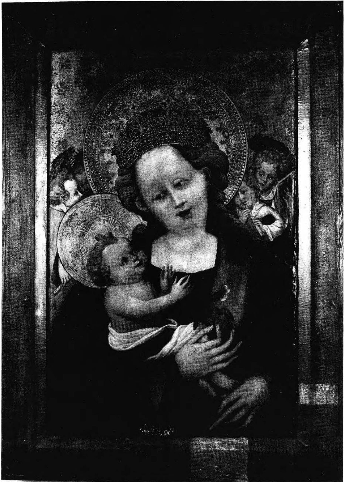
FIGURE 35. Anonymous, Glaubendorf Madonna , Vienna, Erzbischoefliches Dom- und Diocesmuseum (Photo: Erzbischoefliches Dom- und Diocesmuseum).