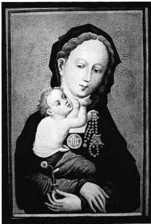
FIGURE 36. Master of St. Veronica, Madonna with the Sweet Pea , centre panel, Cologne, Wallraf-Richartz Museum.