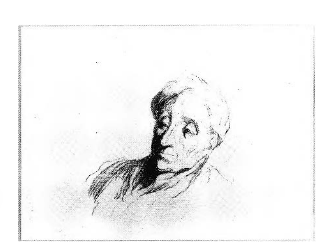
FIGURE 97. Daumier, Head of a man (the historian Michelet?), ca. 1851. Sanguine, 23 × 30.2 cm., present location unknown.