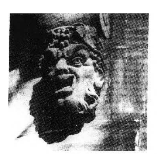
FIGURE 104. Antoine Barye, Mascaron (Silenus) , ca. 1851. Pont-Neuf, Paris.