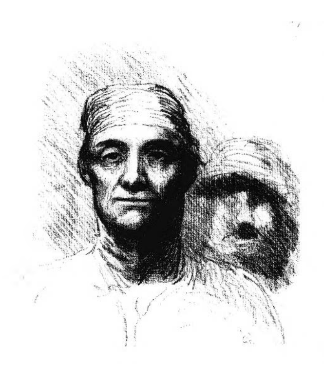
FIGURE 98. Daumier, Two heads of men, 1840s(?). Black chalk, 16.7 \times 15 cm., Museum Boymans-van Beuningen, Rotterdam.