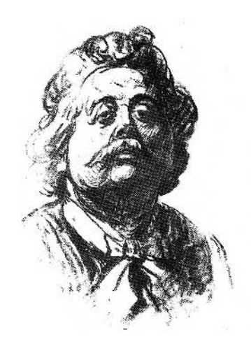
FIGURE 100. Daumier, Portrait of Carrier-Belleuse, 1863. Charcoal and stump, 43 \times 28.5 cm., Paris, Petit Palais.