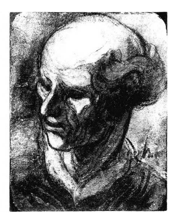
FIGURE 99. Daumier, Study of a Man's Head, ca. 1848-59. Black chalk, charcoal, brush and wash, varnished, laid on board, 23 \times 18 cm., private collection (Photo: K. E. Maison).