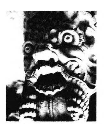
FIGURE 105. Anonymous French, Mascaron , ca. 1610. Paris, Musée de Cluny (formerly on the Pont-Neuf).