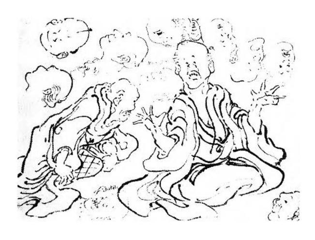
FIGURE 109. Katsushika Hokusai. Page of miscellaneous figures , Edo period, ca. 1830. Black ink (brush) on paper, Washington, D.C., Freer Gallery.