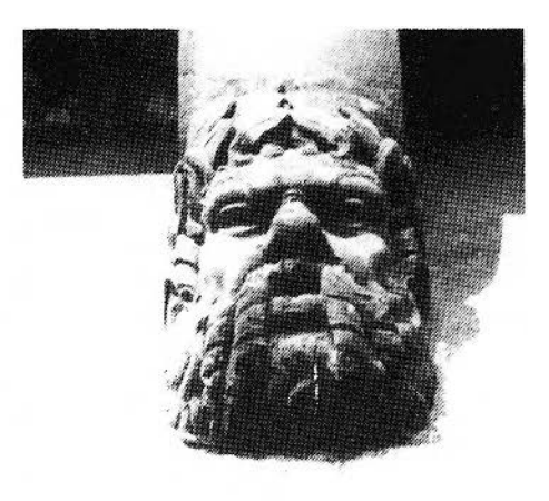
FIGURE 103. François Milhomme(?), Mascaron, 1817. On terre-plein of the Pont-Neuf, Paris, 1817.