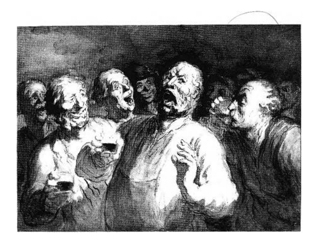
FIGURE 106. Daumier, La chanson à boire, ca. 1860-65. Black chalk, pen and ink and watercolours, 26 \times 34 cm., location unknown.