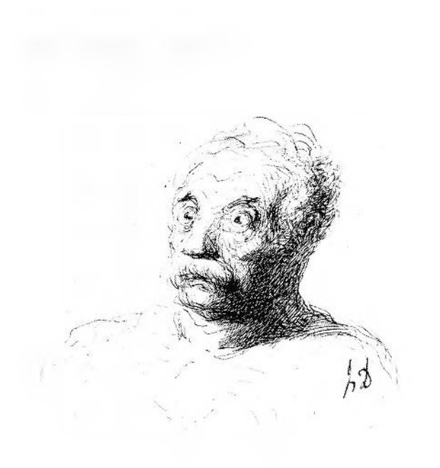
FIGURE 110. Daumier, Head of a man , ca. 1870. Pen and ink, 16.5 \times 12 cm., Hartford, Conn., Wadsworth Atheneum.