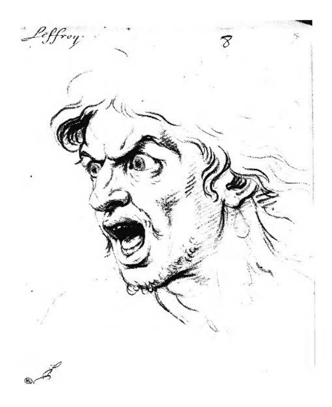
FIGURE 96. Le Brun, "Leffroy" or Terror, ca. 1668. Brownish-grey chalk, 25 \times 20 cm., Paris, Louvre, Cabinet des Dessins, Inv. No. 6497.