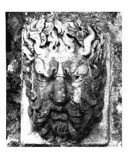
FIGURE 102. Anonymous French, Mascaron (faun), ca. 1610. Paris, Musée de Cluny (formerly on the Pont-Neuf; Photo: N. D. Roger-Viollet, Paris).