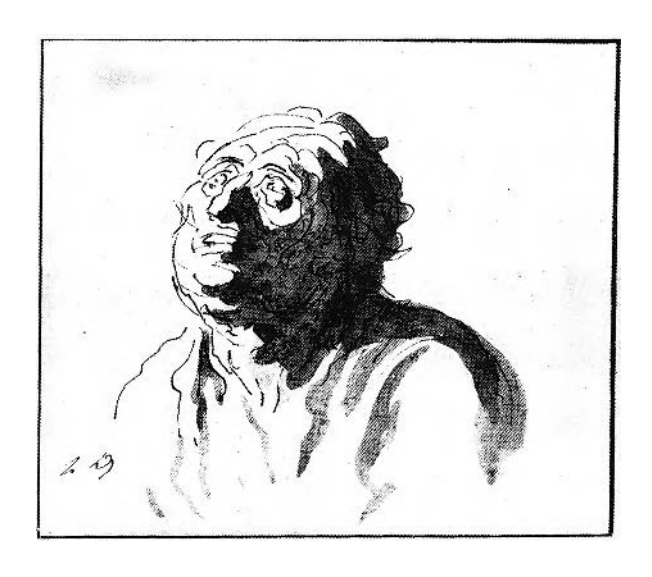
FIGURE 108. Daumier, Head of a man , ca. 1870. Pen and wash, 10 \times 11.5 cm., London, Mr. F. M. Gross.