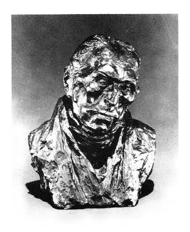
FIGURE 94. Daumier, Head of Guillaume Guizot, ca. 1833. Bronze cast from clay, ht. 22.1 cm., the Armand Hammer Daumier Collection.