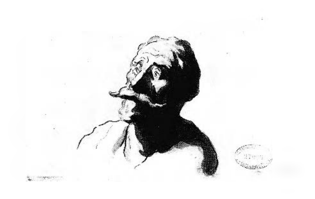
FIGURE 111. Daumier, Head of a man , ca. 1860-69. Black chalk and watercolour washes, 13.8 × 24 cm., Paris, Ecole Nationale Supérieure des Beaux-Arts.