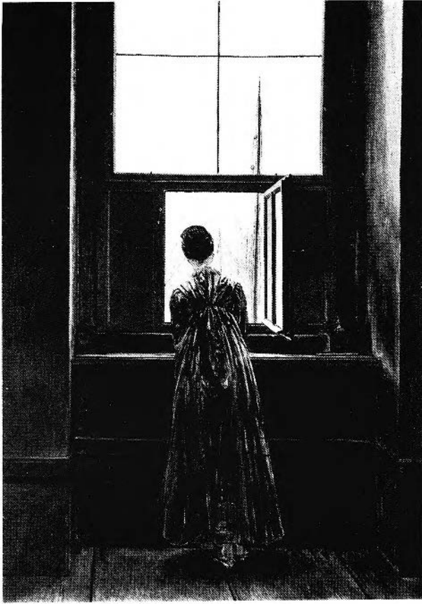
FIGURE 33. Caspar David Friedrich, Woman at the Window , 1822.