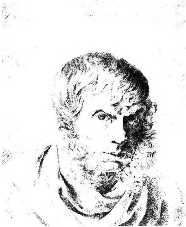
FIGURE 36. Caspar David Friedrich, Self-Portrait , c. 1810, Berlin (East).