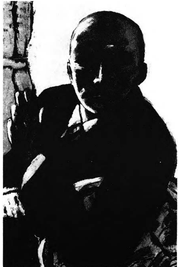
FIGURE 37. Max Beckmann, Self-Portrait in Black , 1944, Munich.