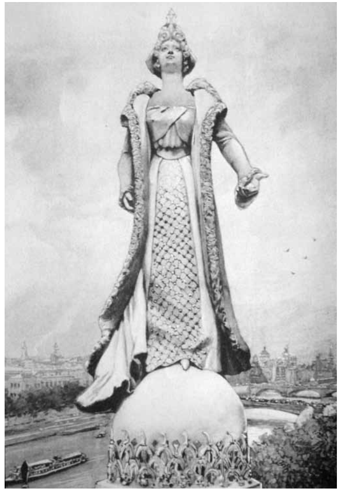
Figure 2. La Parisienne , cover of L'Illustration , 14 April 1900. Collection of the author. Image by Jarrett Duncan.

The general shape and appearance of the gateway was evidently inspired by Binet’s use of and interest in the theories of German botanist Ernst Haeckel. Haeckel promoted Darwinian evolutionary biology, 22 which the French usually called transformism , using the term associated with the French precursor to Darwin, Jean-Baptiste Lamarck. As one account of the gate explained, Binet “has observed the laws of transformism and has noted how, with the lower beings, the natural kingdoms converge and intermingle; finally, and most important of all, he has met Haeckel ( Kunstformen de Natur ) and discovered what an