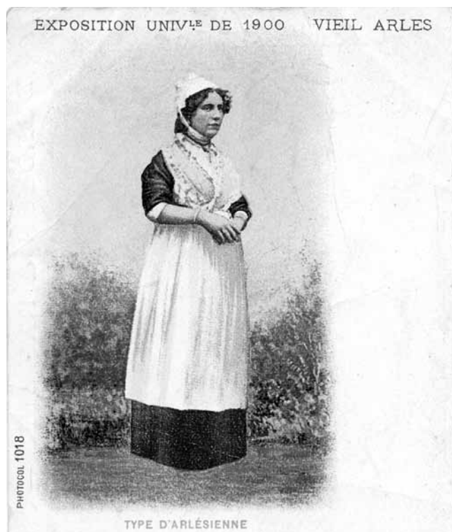
Figure 8. Postcard, Exposition Univ<sup>rs</sup> de 1900 Vieil Arles: Type d'Arlésienne .

lated what life must have been like in the past, when the medieval buildings were new, the Arles reconstruction elided the differences between then and now.