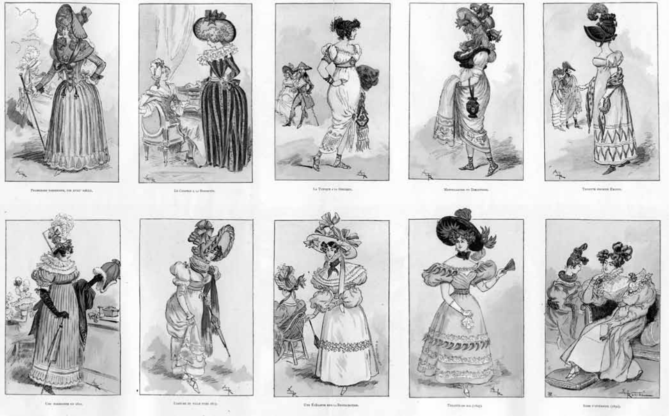
Figure 9. Albert Robida, La Mode et le Costume à Travers le Siècle (1800–1839) . Illustration in L'Exposition de Paris (1900) , vol. 3 (Paris, 1900), supplement no. 25, following p. 196.

tance of the industry to France; as commentators noted, the building was comparable to the Palais du Génie Civil et des Moyens de Transport, which was located directly across the Champ de Mars. 70 The clothing exhibits focused on the current production of fabric and fashion, using display techniques derived from modern department stores. Overall, the displays sought to prove the continued pre-eminence of Paris in world fashion, while simultaneously indicating how far it had advanced from traditional costume. The strength of this industry was attributed to Parisian women since “la persévérance de la femme a sauvé de la ruine une des dernières supériorités que nous demeurant dans les arts de luxe et c’est la France qui continue à dicter la mode aux cinq parties du monde.” 71 Moreover, through this exhibit “la mode française attestera, une fois de plus, la vitalité de son universelle domination.” 72 This French fashion was clearly the haute couture world of Paris. Indeed, the exhibition organizers situated provincial costume as a counter-balance to the heady world of changing Parisian haute couture.