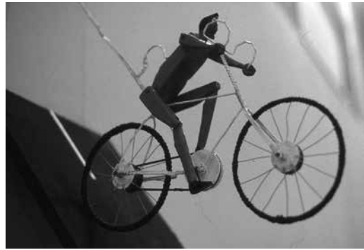
Figures 3–4. Bolívar en tallas de madera (Bolivar in Wood Carvings) , Núcleo 2, installation view, Museo de Artes Decorativas, Havana, Cuba, 1989.