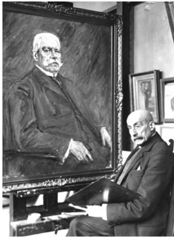
Figure 5. Max Liebermann in his Atelier at Pariser Platz 6 with his portrait of Paul von Hindenburg, ca. 1927.