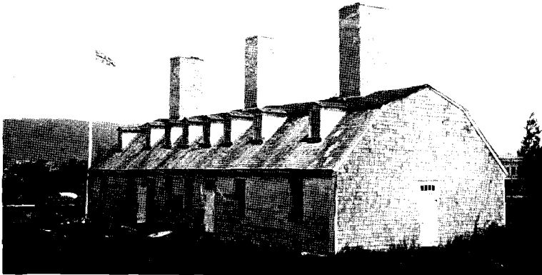
Officers' Quarters, Fort Anne, Annapolis Royal, N.S.