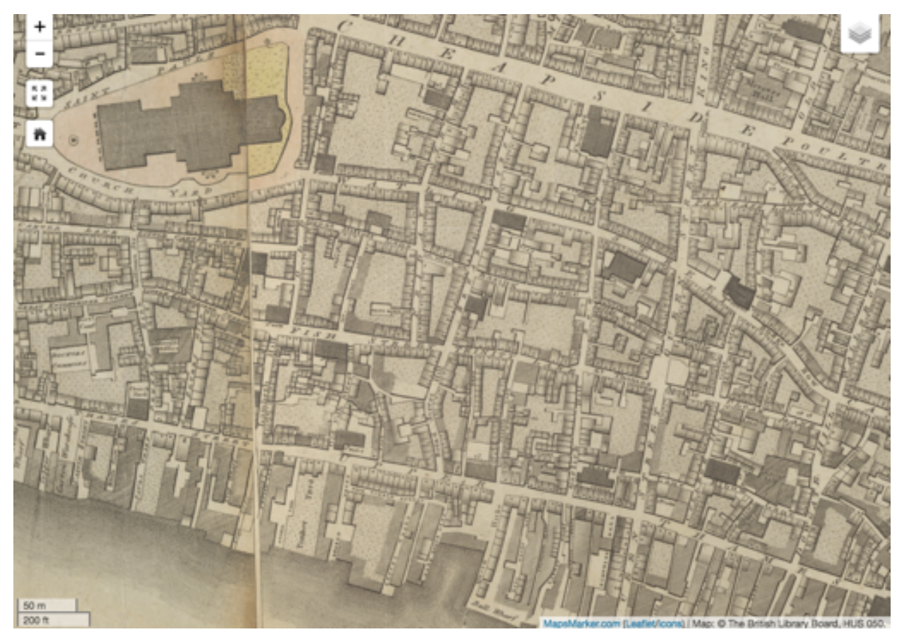
Fig. 1. Close-up from Romantic London showing the intricate detail—note the street names and numbers—of Horwood's Plan

York, and Queen Mary, but also by non-academics, many of whom reportedly visit simply to plot their current home on Horwood's eighteenth-century map.