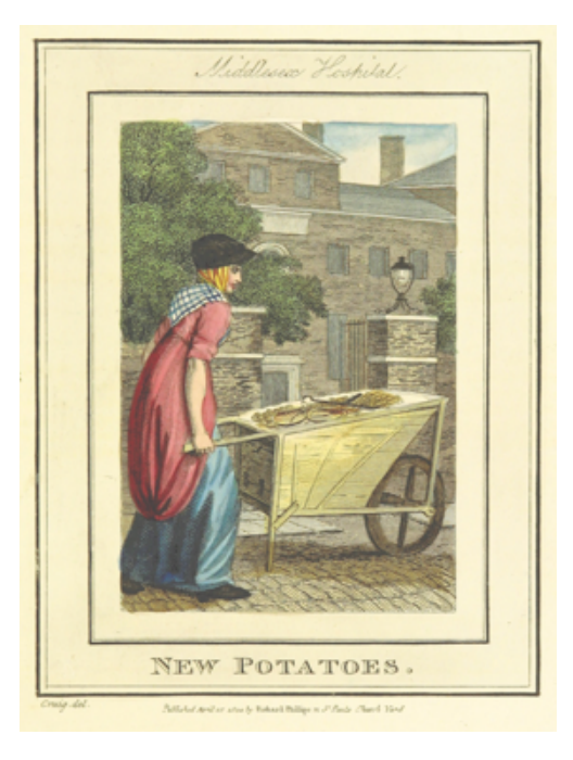
Fig. 4. Image from Modern London of a woman selling potatoes outside Middlesex Hospital