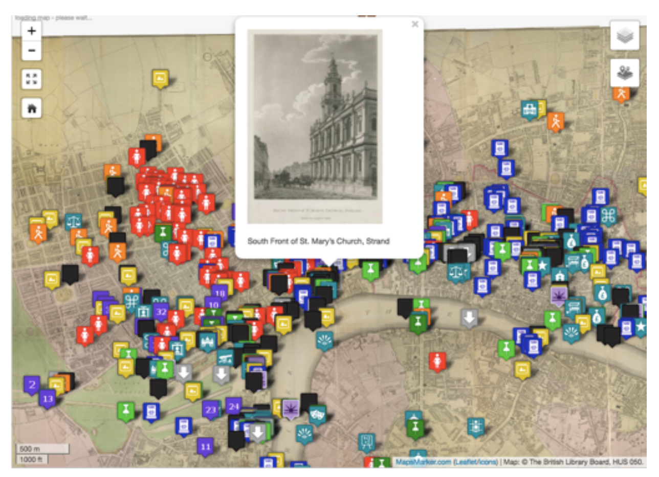
Fig. 2. Sample "All Curations" view from Romantic London , with pinned sites from all nine books and a pop-up illustration for one particular location

8. Romantic London currently offers five possible base map layers on which to view pinned locations from the nine books. Two of the base layers feature Romantic-era maps (Horwood's Plan [1792-99] and Faden's 1819 revision of the Plan ), and the remaining three are up-to-date maps in OpenStreetMap, Google Maps roadmap view, and Google Maps satellite view. Pins marking sites from each book constitute the second type of layering. Currently there are nine possible layers of pins (one per book) on each base map. As seen in Figure 2 below, the "All Curations" screen allows researchers to view one, several, or all of these layers—with up to 636 pins total—by selecting or deselecting individual books via the "layer" icon in the top right corner. Book layers can be altered by clicking on the "pin" icon just below the "layer" icon.