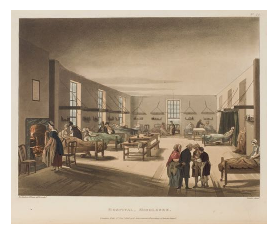
Fig. 5. Rowlandson and Pugin's illustration of Middlesex Hospital in Microcosm of London

from Ackermann's The Microcosm of London (see Fig. 5). Pugin and Rowlandson's image shows a ward with nine patients attended by nurses and visitors and a small group in the foreground huddled around someone who appears to be a doctor. Looking more carefully, we realize this scene is dominated by women, as, besides the predominantly female nurses and visitors, all nine patients are women.