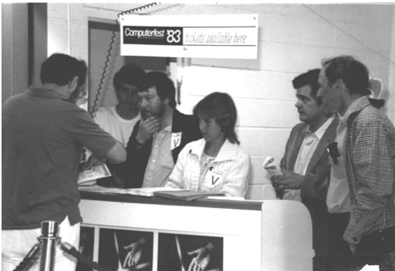
Figure 5. Lining up for tickets at Computerfest'83.