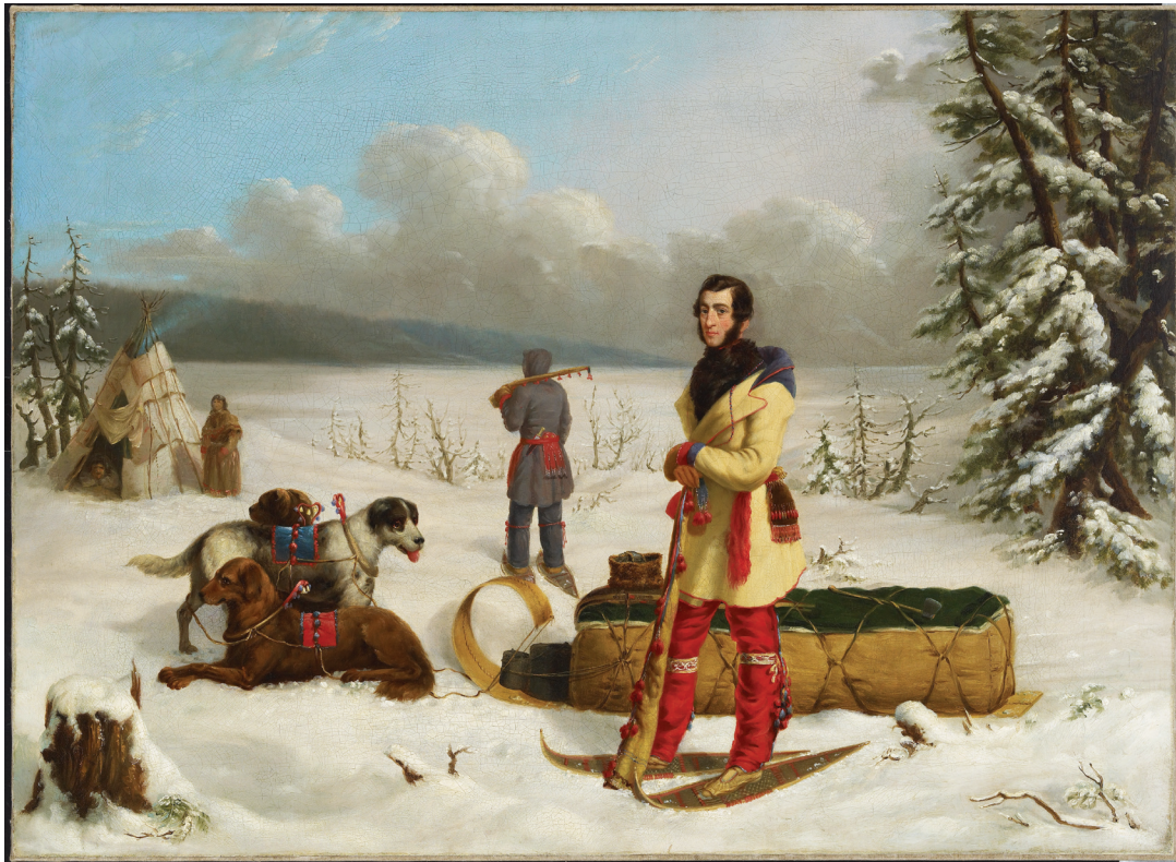
Figure 1. Paul Kane, Canadian, 1810-1871. Scene in the Northwest - Portrait, c. 1845-1846. Oil on canvas. Overall: 55.5 x 76 cm (21 7/8 x 29 15/16 in.). The Thomson Collection © Art Gallery of Ontario, 2009/507.